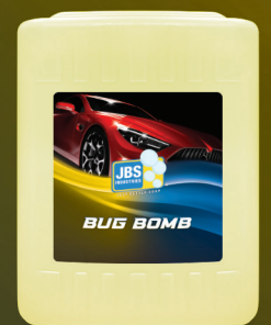
(BB-100) BUG BOMB