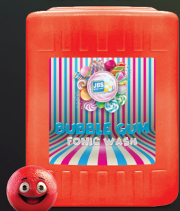
(CAN-101) ★ Bubble Gum Fonic Wash Bubble Gum Scent