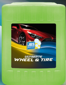
(TR-115) ULTIMATE WHEEL & TIRE Lemon Scent