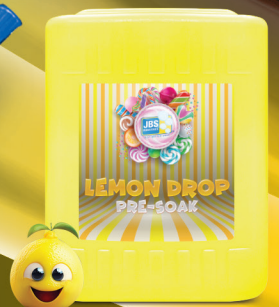
(CAN-400) ★ Lemon Drop Pre-Soak Lemon Drop Scent