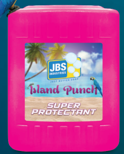
(IP-801) ★ ISLAND PUNCH SUPER PROTECTANT Island Punch Scent